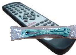
IR Transmitter and IR Receiver (1.5m)