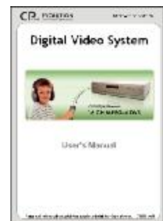
Manual & Quick Start