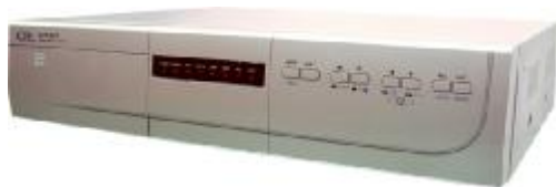
Digital Video System