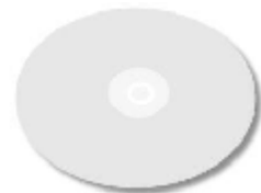
Licensed Software AP